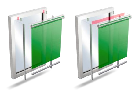
Side guide rails